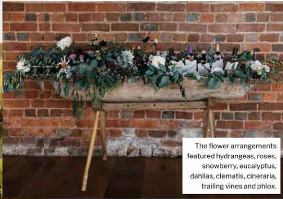
The flower arrangements featured hydrangeas, roses, snowberry, eucalyptus, dahlias, clematis, cineraria, trailing vines and phlox.