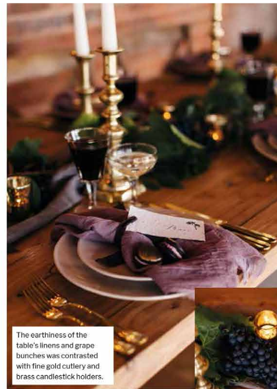
The earthiness of the table's linens and grape bunches was contrasted with fine gold cutlery and brass candlestick holders.