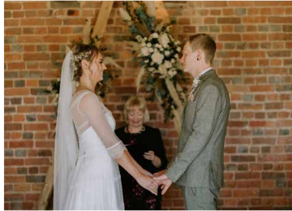
"I truly felt like all my dreams had come true"