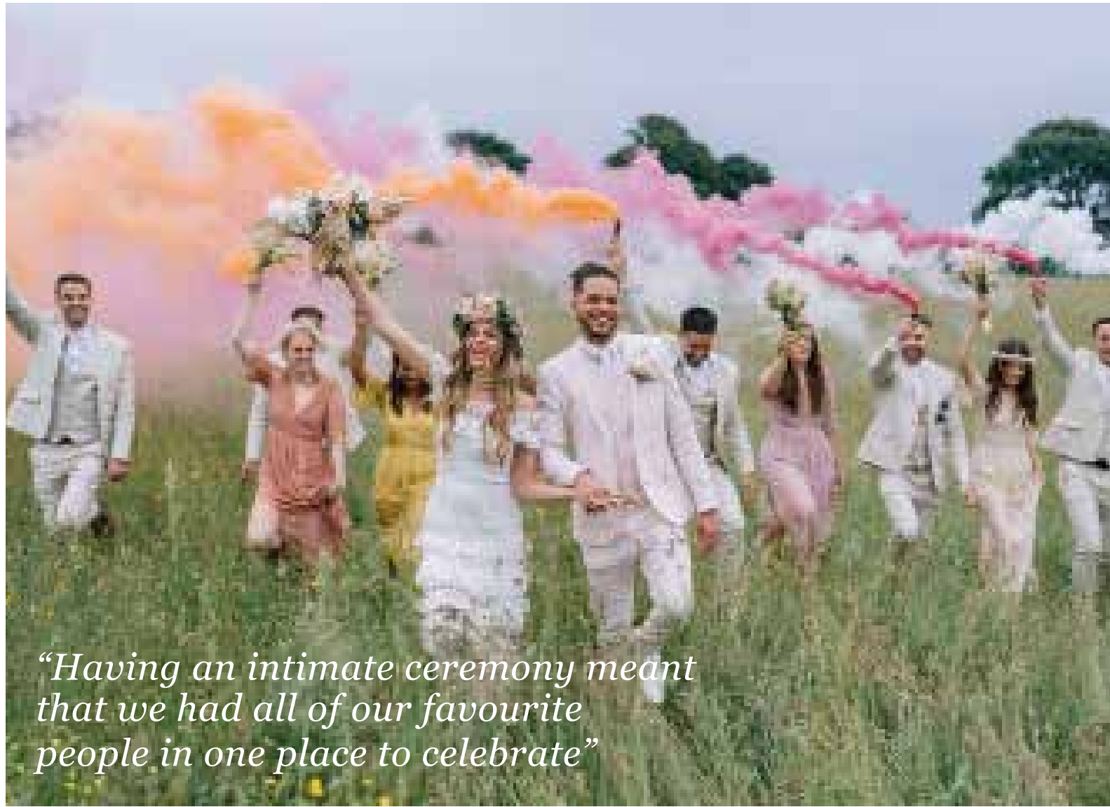
“Having an intimate ceremony meant that we had all of our favourite people in one place to celebrate”